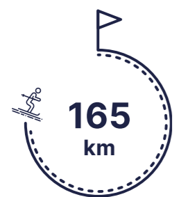
Alpine ski slopes